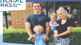
Confraternity of Christian Doctrine (CCD)