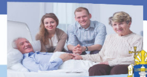
Hospital Chaplaincy and Pastoral Care